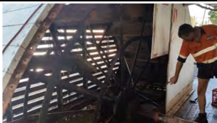
Working on the Paddle

For those of you who have misplaced your renewal form, forgotten or been away and still wish to make payment, please ring Denise 0488 566 414 to arrange payment.